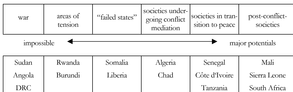
Diagram 2: Scale of Potentials for Security-Sector Reform

Poor preconditions for comprehensive security-sector reform also prevail in so-called “failed” or “collapsed” states. Characteristic of this development is the loss of state control